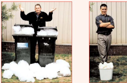
Compare the waste of 50 pallets wrapped in film (left) versus the waste resulting from 50 pallets wrapped in 3M Stretch Tape using Safetech's Stretch Tape Easy Wrapper.

The costs of handling and disposing of waste film and netting is dramatically lowered when 3M stretchable tape is used. 3M tape is simple to apply and easy to remove.